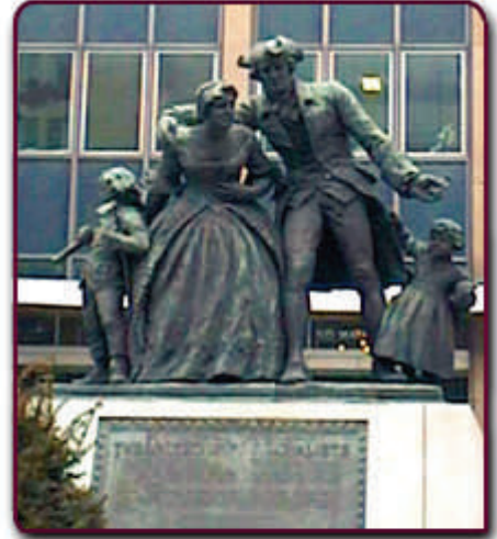
The United Empire Loyalists Statue at McMaster University Downtown Centre