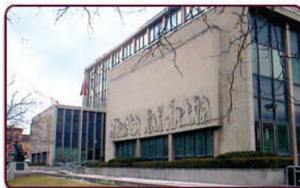
McMaster University Downtown Centre

Since the City of Hamilton donated the old courthouse building to McMaster as part of the "Changing Tomorrow Today" campaign, departments have gradually painted, purchased new furniture and in one case erected walls to settle in their new "home away from home".